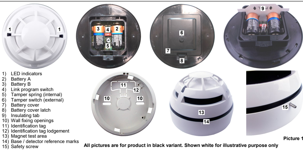
All pictures are for product in black variant. Shown white for illustrative purpose only

TW-DO-01/BL is battery powered and doesn't need any system cabling installation.