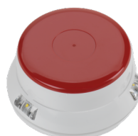
Red blanking cap (LID100-SG/R)