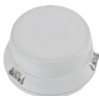
White blanking cap (LID100-SG/W)