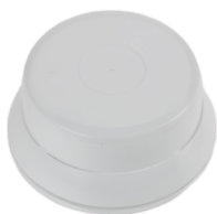
White blanking cap (LID100-SG/W)