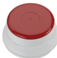
Red blanking cap (LID100-SG/R)